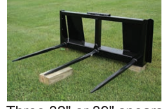
TRIPLE - BST

Three 32" or 39" spears along the bottom of the unit, 48" wide