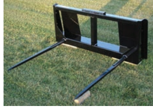
DOUBLE - BSD

Two 39", 43" or 49" spears along the bottom of the unit, 48" wide