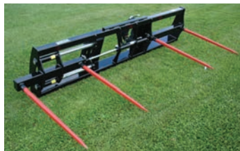
QUAD ADJUSTABLE DOUBLE - BSQADB

Four 43" or 49" spears with 100" wide frame width, made to move two round bales, 98" wide 18" cylinder stroke to pull round bales together when loading or placing, adjustment 60" - 78" center to center