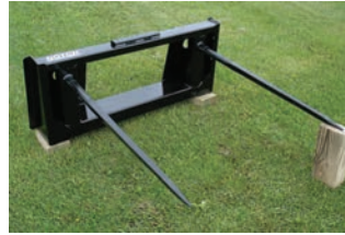
HIGH DOUBLE - BSHD

Two 39", 43", or 49" spears along the top of the unit, 48" wide