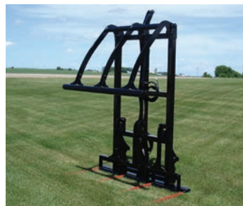
QUAD with Push Off and Hold Down - BSQ-PH

Four 39" spears along the bottom of unit Made to move up to three large square bales