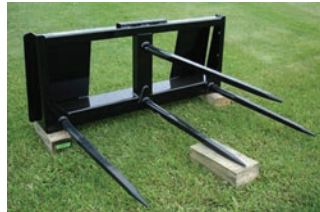
UNIVERSAL - BSU

Three 32" or 39" spears along the bottom and one 43" or 49" spear in the center of the unit, 48" wide