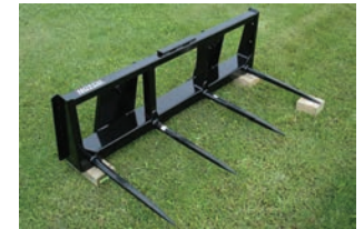
QUAD - BSQ

Four 32" or 39" spears along the bottom of the unit, 71" wide