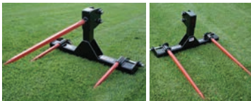
THREE POINT MOUNTED SPEARS - BS3PS/BS3PD

Available with single or double spears CAT 2 & 3 narrow Optional fifth wheel hitch and ball available