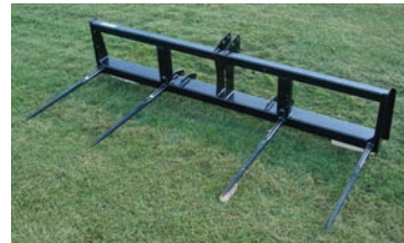
QUAD - DOUBLE BALES - BSQDB

Four 39", 43", or 49" spears along the bottom of the unit, designed to move two round bales, 102" wide